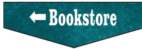
BDW02 - Teal with Sentence Case Text