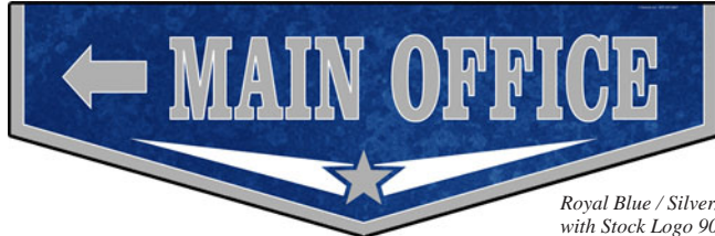
Royal Blue / Silver/Gray with Stock Logo 909

Double Wedge with Logo & Trim - 12" h x 36" w