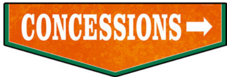
BDWC02-T - Orange / Green with Capitalized Text