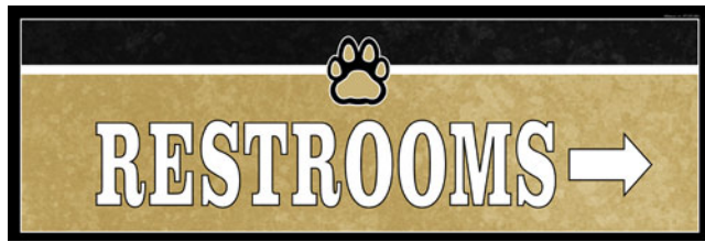
Old Gold / Black with Stock Logo 604

Item #: DBSDW02 You Choose: 1. Text for each banner (Capitalized) - Price: $78.00 Translations must be included 2. Text & Trim color 3. Banner color