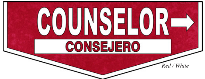
Red / White

Item #: DBDW02 You Choose: 1. Text for each banner (Capitalized) Price: $78.00 2. Text & Trim color 3. Banner color 4. Logo (See order form for details)